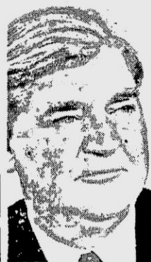
ANEURIN BEVAN ... at home to convalesce

Though home at last to convalesce from his near-fatal operation for an undisclosed ailment, doctors feel it will be months before