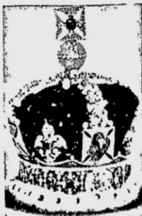
IMPERIAL STATE CROWN

Replicas of the most famous Diamonds in the world, the Queen's Tiaras and the "Crown Jewels"